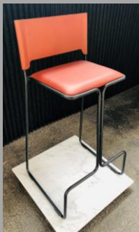
Final project in collaborate with OX Denmarq.

98-01 - Merkonom International Business at Niels Brock Business School.